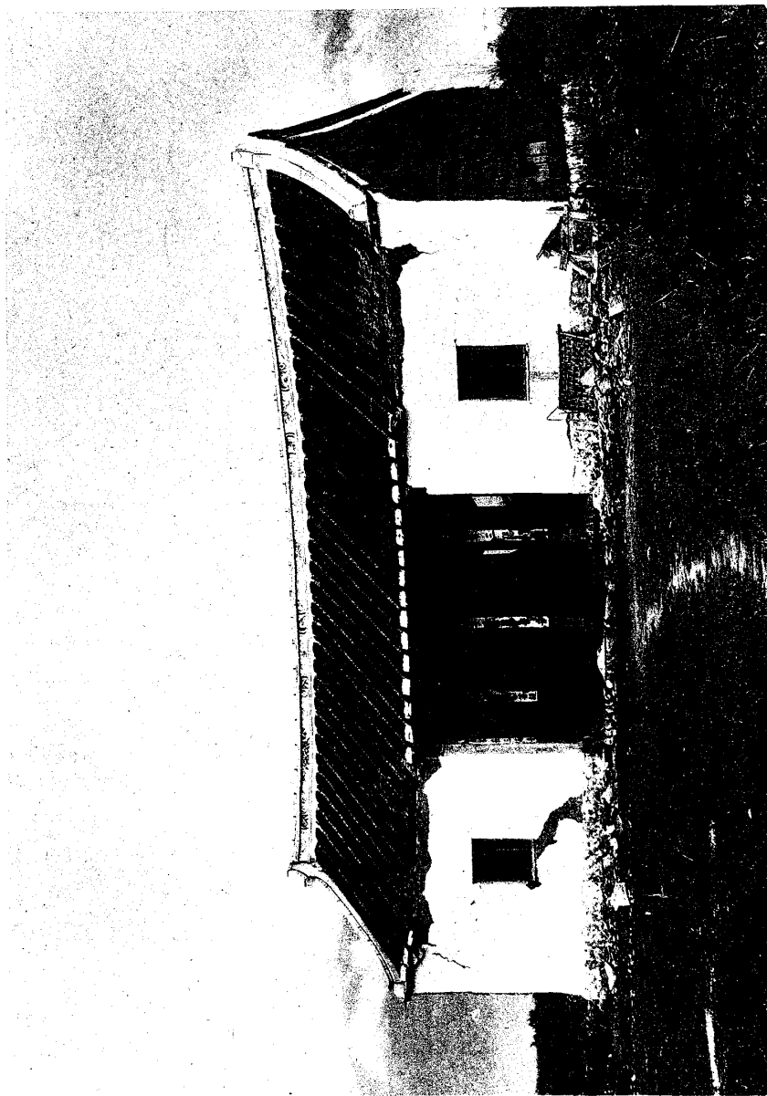
Fig. 2. The Byo (Temple) at Suibi, damaged by the Earthquake of Jan. 11, 1908.