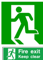
Fig. 2 Everyone should know the official signs to indicate fire exits. The students used the official ISO symbols, so they are copyright free.