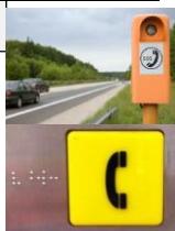
Fig. 1 We dealt with communication. The students chose an interphone on the highway and explained how useful it is.