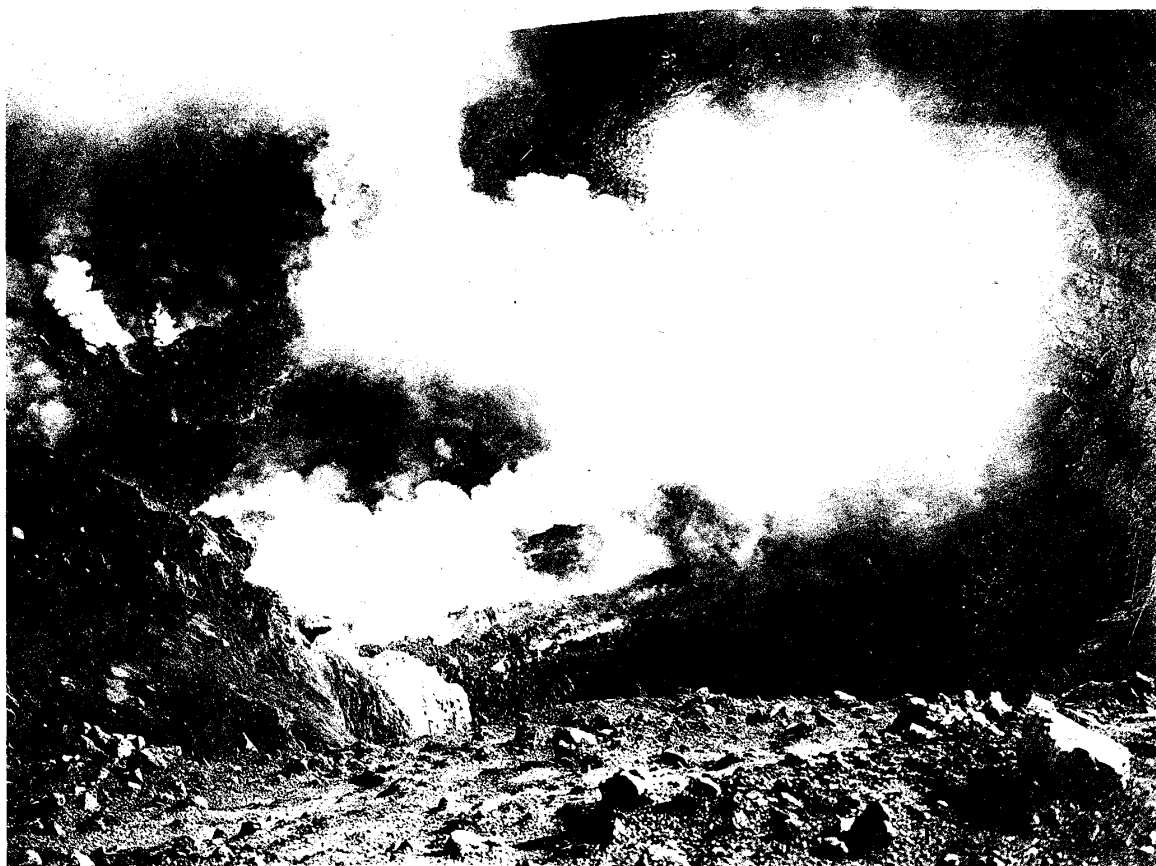
Fig. 74. Crater of Asama-yama, seen from SSW, on Aug. 23rd, 1912.