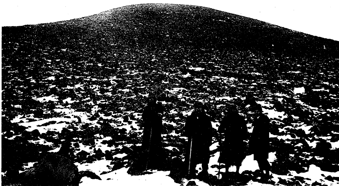
Fig. 75. Central cone of Asama-yama, seen from W. at the entrance of Muken-dani. Dec. 21st, 1912.