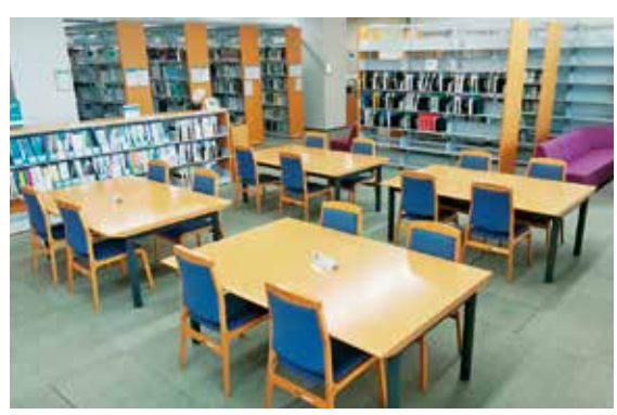
Institute for Solid State Physics Library