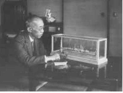
Yuzuru Hiraga Collection (Kashiwa Library)