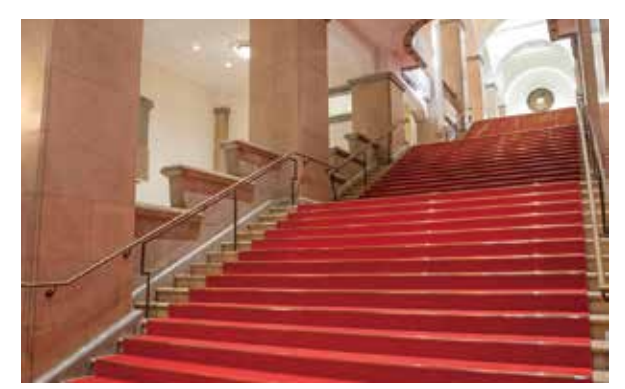
General Library (current)