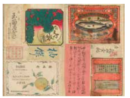
Tanaka Yoshio Collection (General Library)