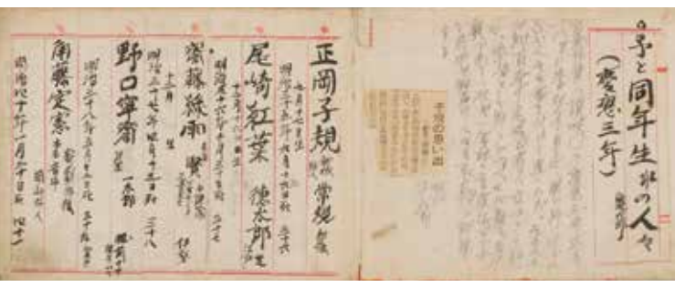
Gaikotsu Collection (Meiji Shinbun Zasshi Bunko)