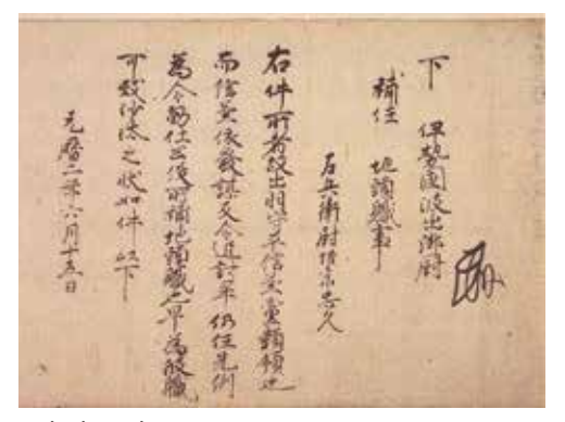
Rekidai Kikan Minamoto no Yoritomo Kudashibumi from Documents of the Shimazu Family (Historiographical Institute Library)