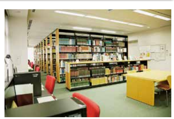
Research Center for Advanced Science and Technology Library