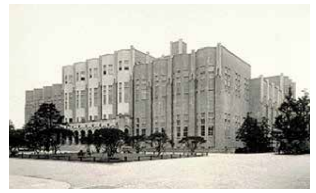
General Library (completed in 1928)