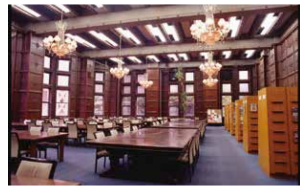
General Library (around 2010)