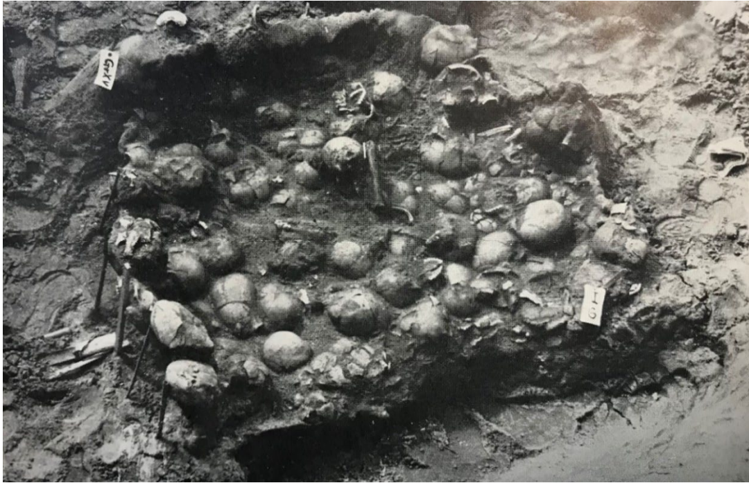
Figure 4. Grave XV, a mass cranial grave discovered during the second excavation of the Zaimokuza site (reproduced from Suzuki et al., 1956: Plate 2).