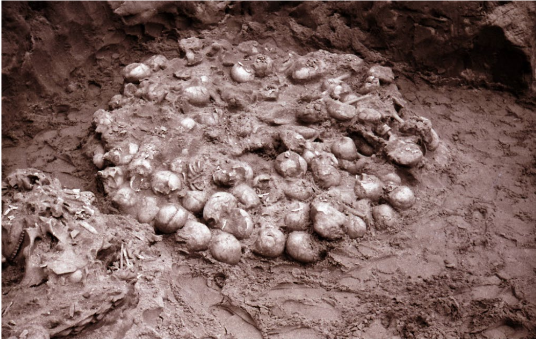
Figure 5. A photograph of burials discovered during the third excavation of the Zaimokuza site. A large mass cranial grave, XXIX (middle) and a smaller grave mixed burial with horse bones, XXX (left) are pictured (reproduced from Suzuki et al, 1956: Plate 1).