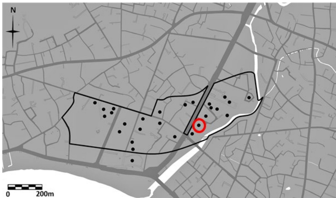
Figure 2. A map of the Yuigahama area of Kamakura. The Zaimokuza site is circled in red. Black dots indicate archaeological sites from which human skeletal remains dating to the medieval period have been recovered. The black outline shows the area dubbed ‘Yuigahama medieval graveyard’.