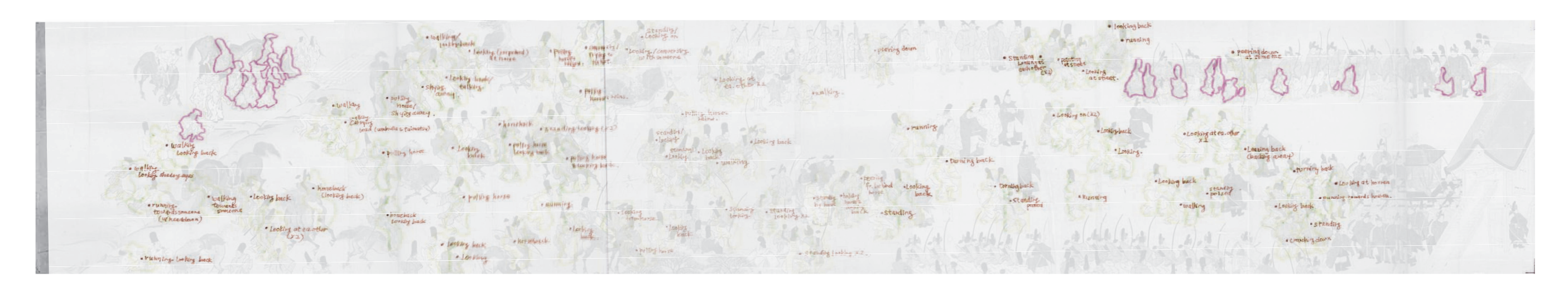
(b) sitting (& other actions)