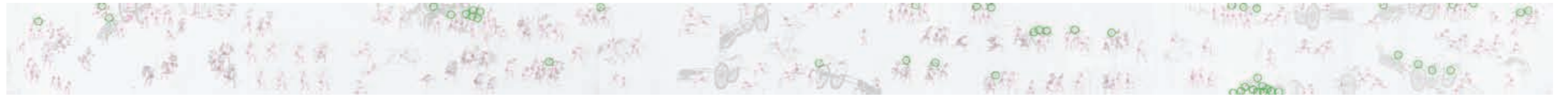
(d) "layered" people