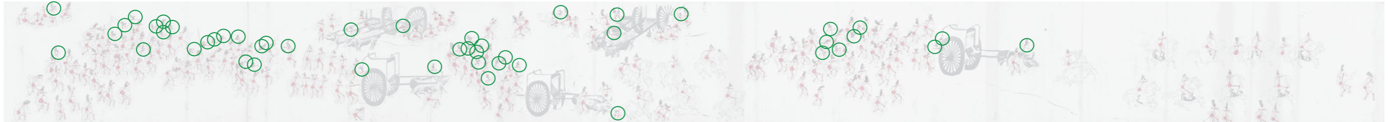
(d) "layered" people