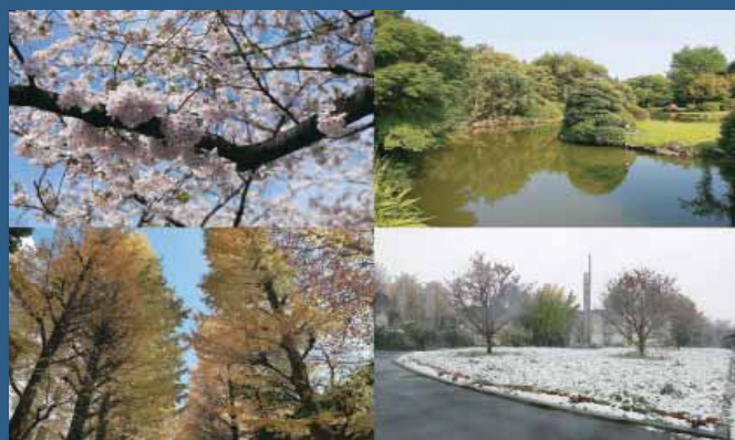
Cherry blossoms on Hongo Campus in spring, Koishikawa Botanical Garden in summer, ginkgo trees on Komaba Campus in autumn and Mitaka International Hall of Residence in winter.

ginkgo trees in autumn. The summer can be hot, but the winter is not cold. Overall, the weather is usually comfortable. Near the campuses, there are also many sightseeing places such as Ueno, Asakusa and Ginza.