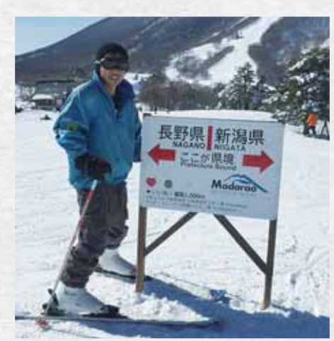
The author at the foot of a hill.

UTokyo certainly understands the language barrier we international students are facing and provides free Japanese courses for us. I must say that for me the most difficult part of Japanese is to