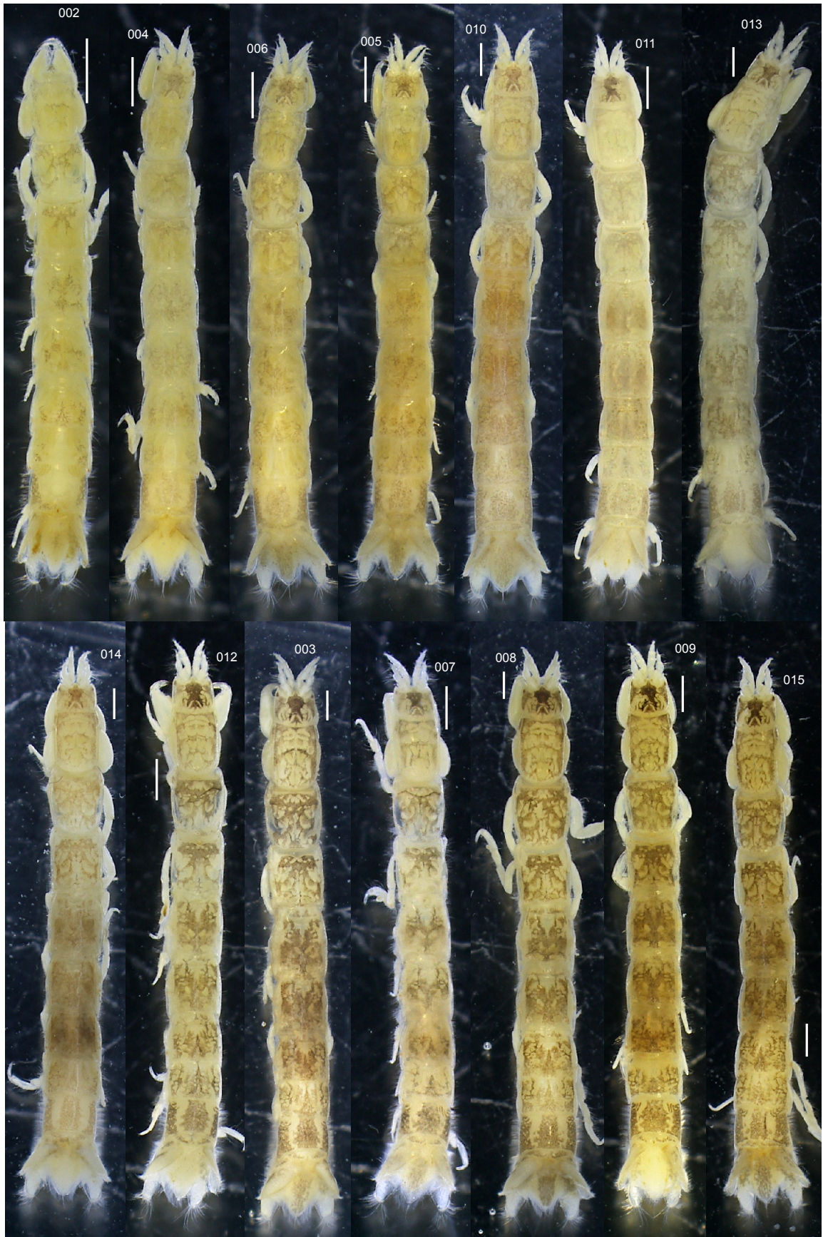
Fig. 2-28 Intraspecific variation in dorsal pigmentation of Cyathura muromiensis collected from type locality. Three-digit number indicates the specimen's number (Muromi-topo-XXX). Head was removed from the number 002. Scale bar: 1 mm.