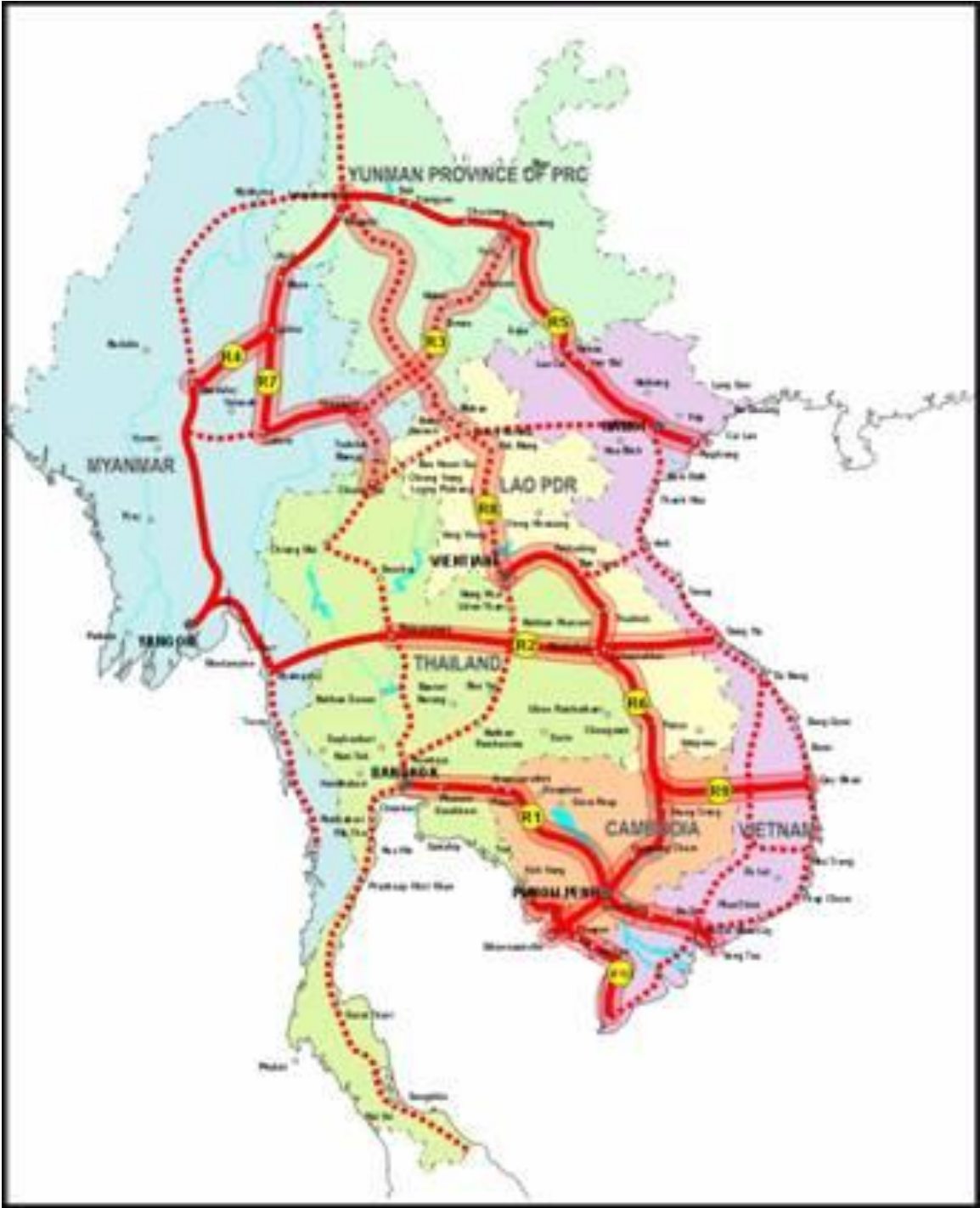
Figure 5.2 ASEAN Highway Network