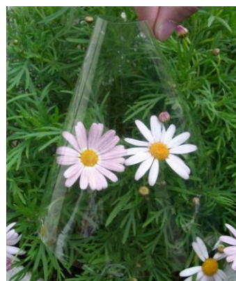
Fig. 1. Appearance of a cellulose film prepared from the \text{NaOH} /urea solution.

Transparent and bendable regenerated cellulose films prepared from aqueous alkali/urea solutions (Fig. 1) exhibited high oxygen barrier properties at 0% RH, which are superior to those of conventional cellophane, poly(vinylidene chloride), and poly(vinyl alcohol). The oxygen permeabilities of these cellulose films varied widely depending on the conditions used to prepare them. The oxygen permeabilities of the